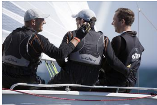
Day 5 of the Laser SB3 World Championships